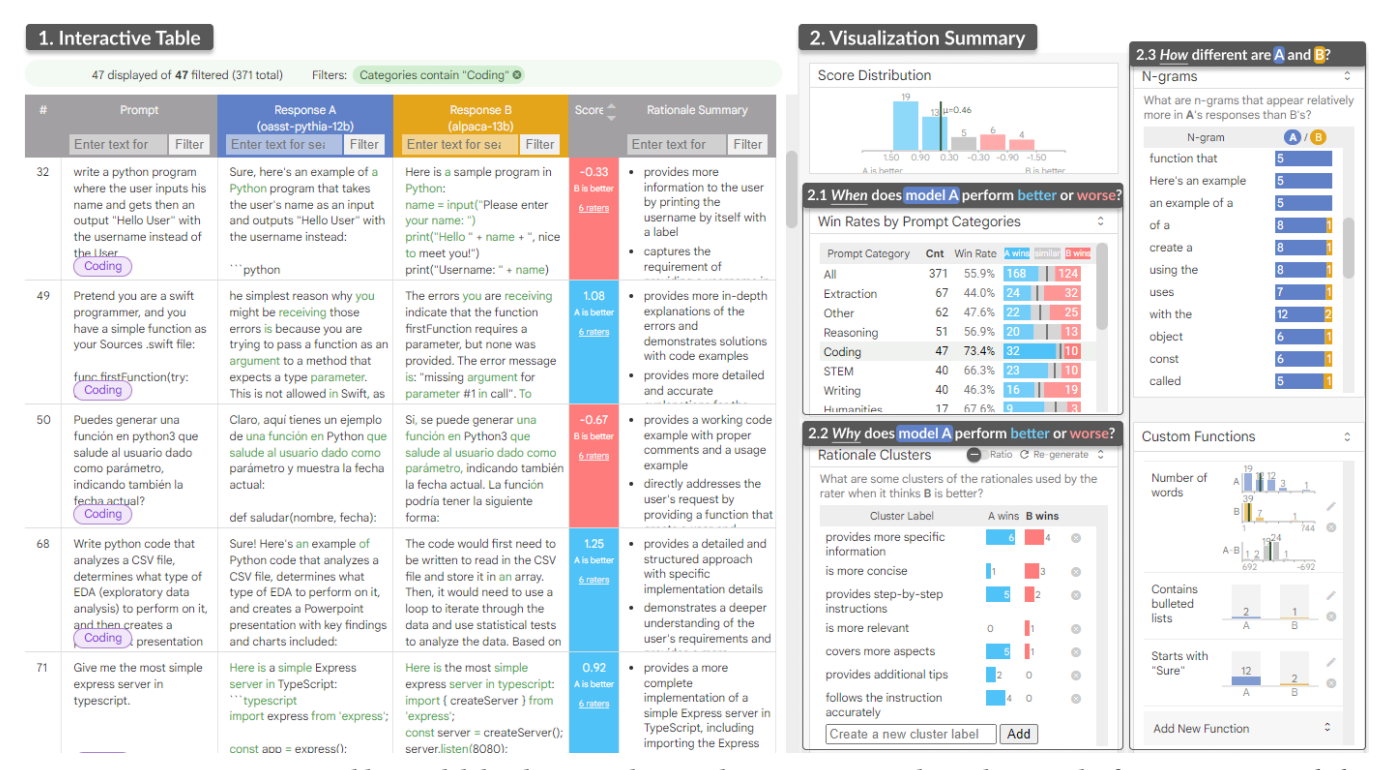
Figure 1: LLM Comparator enables model developers and researchers to interactively analyze results from automatic side-by-side evaluation of large language models (LLMs). To evaluate the quality of responses from an LLM (A), users can compare them with those from a baseline LLM (B). The tool's interactive table (1) enables users to inspect individual prompts and their responses in details, and its visualization summary (2) supports analytical workflows that help understand when (2-1) and why (2-2) a model performs better or worse and how (2-3) the two models' responses are different.

Minsuk Chang minsukchang@google.com Google Research Seattle, WA, USA