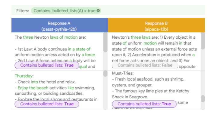
Figure 4: Users can dynamically create functions that apply to responses. A function specified as a regular expression (i.e., "\n([*-])\s") checks if each response contains bulleted lists, and their results are displayed as purple chips.

to each individual response and return either boolean or numeric values. For boolean values (e.g., whether it contains bulleted items), the tool visualizes the results as percentage bar charts; for numeric values (e.g., word count), it displays histograms. They can be displayed on top of the responses when selected (as shown in Figure 4).